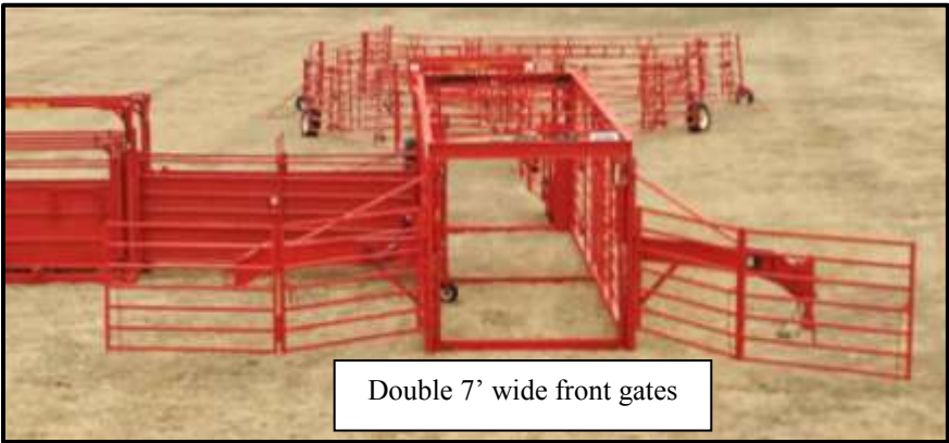
Double 7' wide front gates