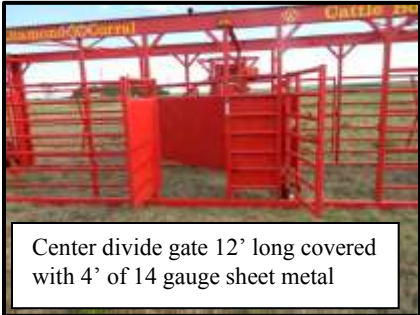
Center divide gate 12' long covered with 4' of 14 gauge sheet metal