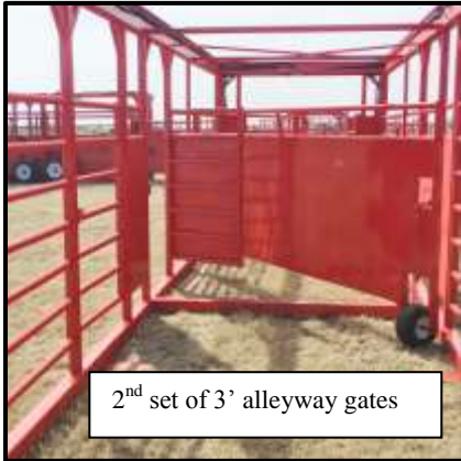
2 nd set of 3' alleyway gates