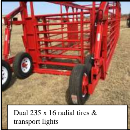
Dual 235 x 16 radial tires & transport lights